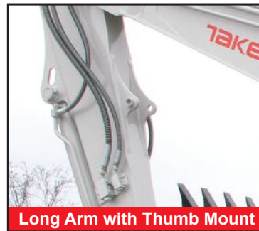
Long Arm with Thumb Mount