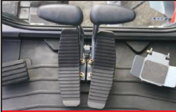
Large Floor with Foot Rest