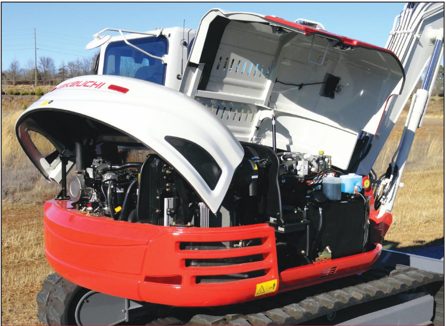
Large lockable service hoods provide vandalism protection and outstanding maintenance access.

automatic climate control system keeps the operator comfortable year round. Service and maintenance access is greatly enhanced with an engine and side cover that open high overhead for unmatched ground level serviceability. Key hydraulic components including the main control valve, hydraulic tank and sight gauge, and selector valve are mounted outboard for easier inspection and maintenance, and all daily inspection points for the engine can be easily accessed from the rear of the machine.