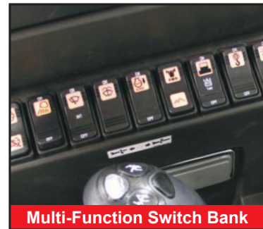
Multi-Function Switch Bank