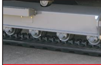
Triple Flange Track Rollers