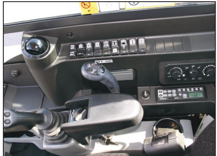
Automotive Styled Interior