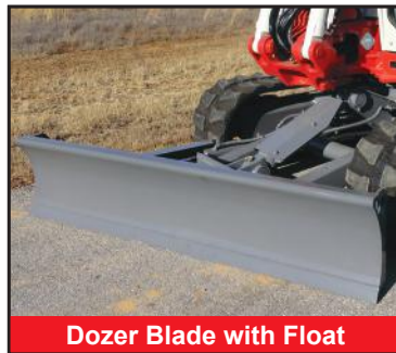
Dozer Blade with Float